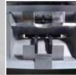
Extra reject pocket for non-interruption note processing.