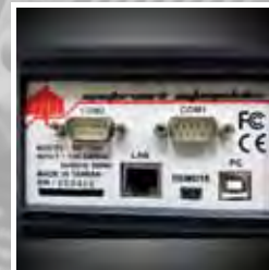
Full range of I/O port