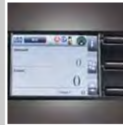
Large TFT display with MA unitized interface design, easy to use