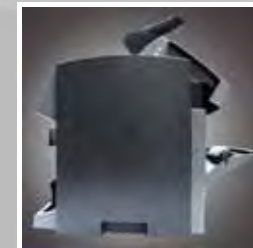
Easy opening bill path for fast paper jam removal and daily maintenance.