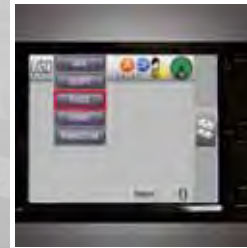
Compact two pocket machine with various sorting function: DD, Face, Orientation and Emission.